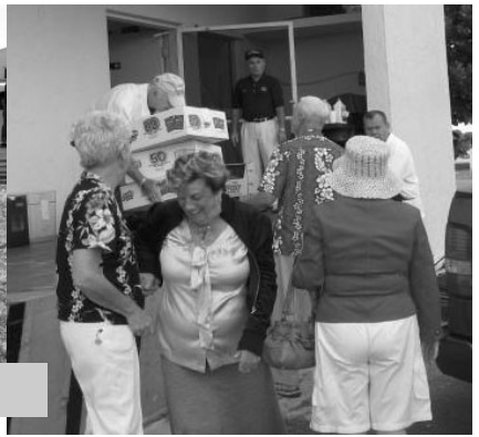
WE WILL ALWAYS REMEMBER PEARL HARBOR