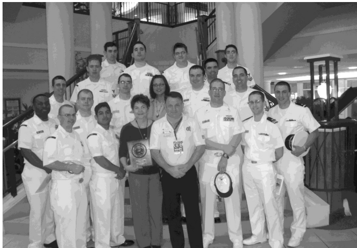
Chris Evert Children's Hospital Outreach ComRel Visit