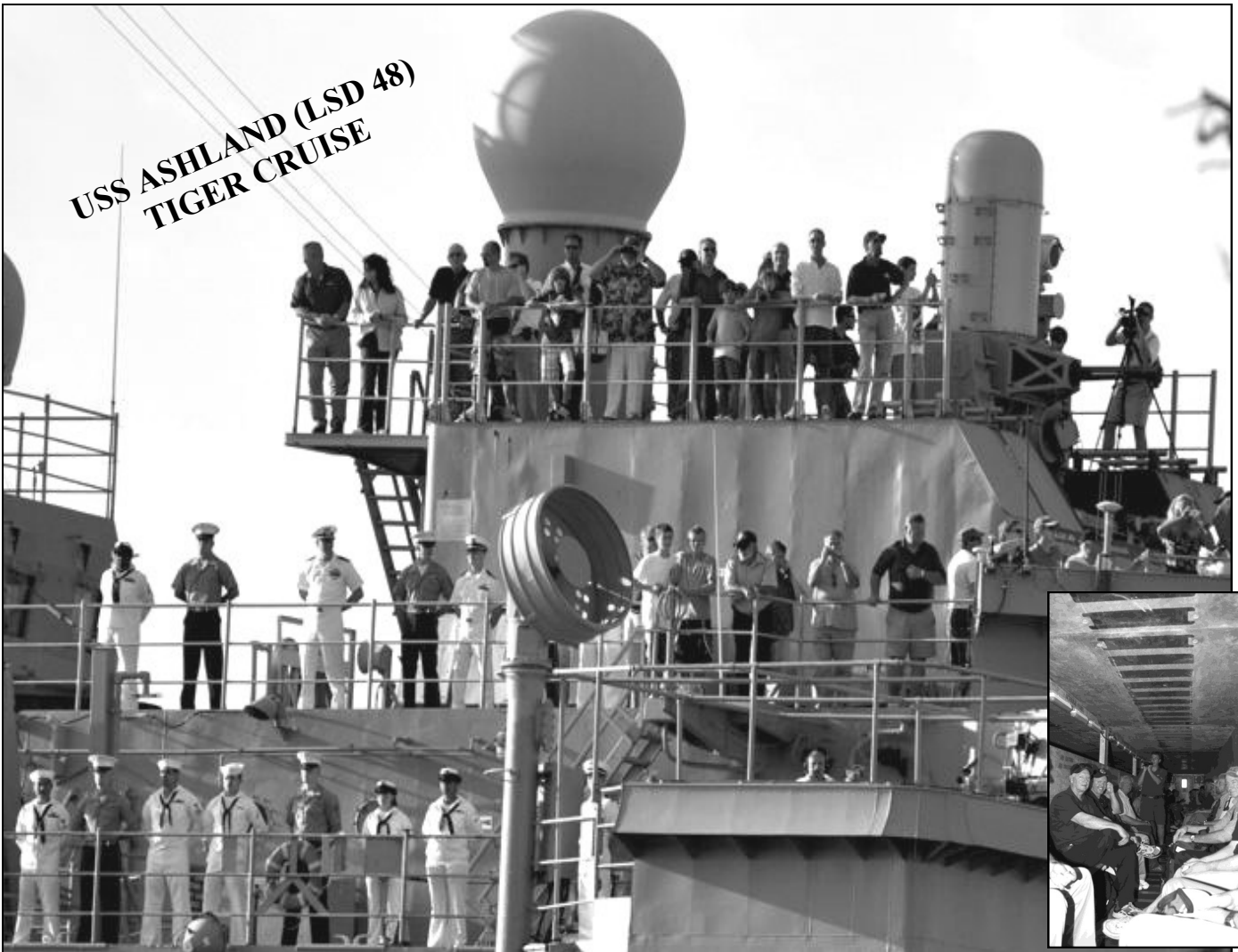
USS ASHLAND (LSD 48) sailors and Tiger Cruise participants man the deck as she enters Port Everglades.

They will have these moments to remember!