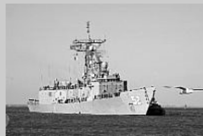
USS CARR (FFG 52) COMING HOME

PEO Ships is responsible for the development and acquisition of U.S. Navy surface ships and is currently managing the design and construction of a wide range of ship classes and small boats and craft. These platforms range from major warships, such as front line surface combatants and amphibious assault ships to air-cushioned landing craft, oceanographic research ships and special warfare craft. PEO Ships has delivered 33 major warships and hundreds of small boats and craft from more than 30 shipyards and boat builders across the United States.