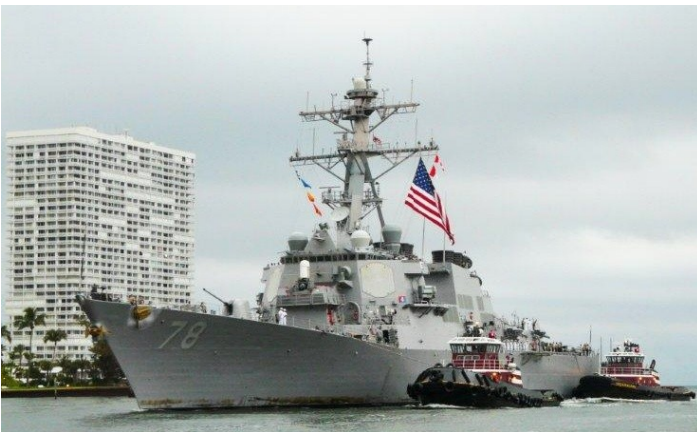
USS PORTER DDG-78