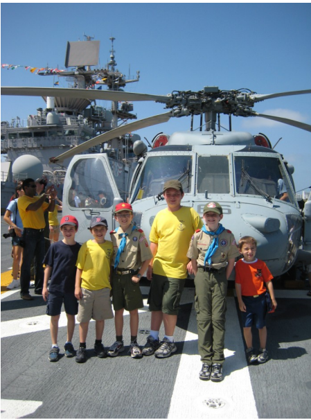
Cub Scout Pack 7 / Boy Scout Troop 7 Coral Gables enjoyed a tour aboard the USS Iwo Jima