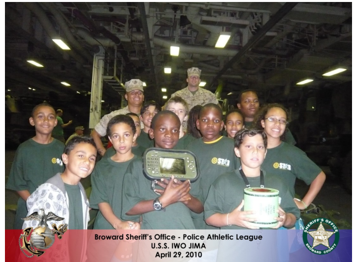
Broward Sheriff's Office - Police Athletic League U.S.S. IWO JIMA April 29, 2010