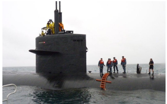
USS NEWPORT NEWS SSN-750

E-MAIL - bcnavyleague@yahoo.com - Visit our Web Site - www.bcnavyleague.org