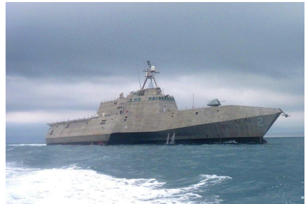
USS INDEPENDENCE LCS-2