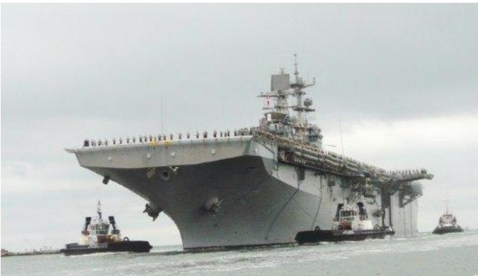
USS IWO JIMA LHD-7