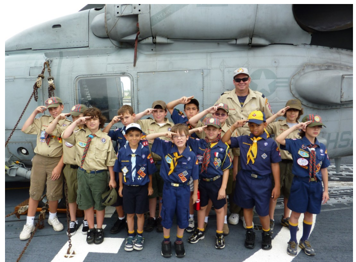
Cub Scout Pack 441 aboard the USS Iwo Jima