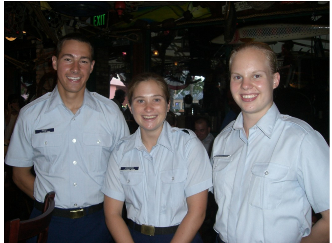
Above: Eagle's Cadets enjoy reception at Briny's