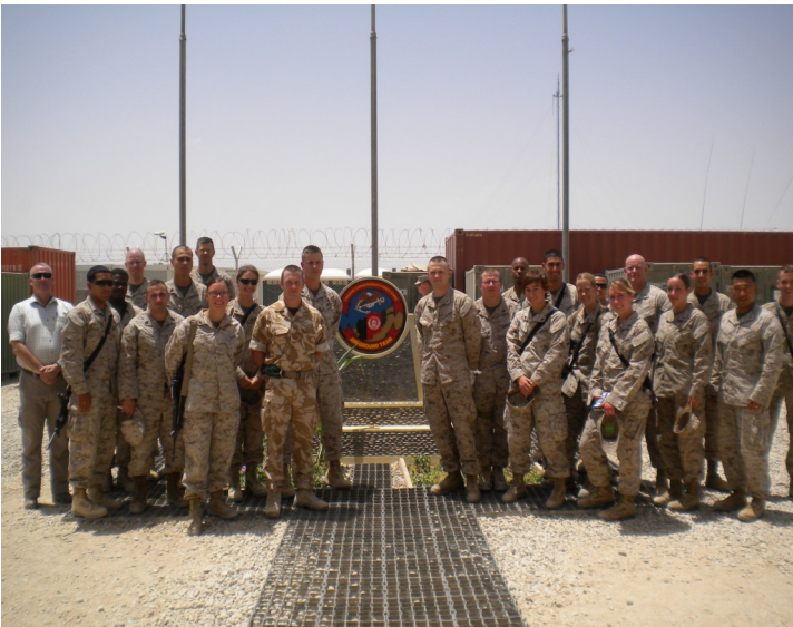
Photo of the 1st Radio Battalion Forward, Marine Expeditionary Force Forward—recipients of recent Council care packages

Each package costs approximately $100 to fill and $12.50 to mail. Tax free contributions in any amount are welcome and can be sent to BCNL, P O Box 39252, Fort Lauderdale FL 33339 or you can make a donation at any dinner social.