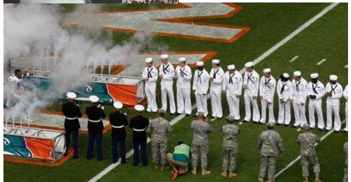
Below: Sailors got an opportunity to go on the field prior to the Dolphins/Redskins game