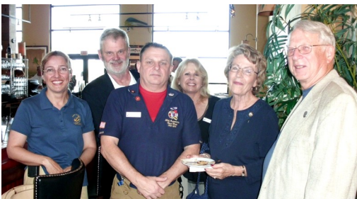
Council members at the VIP Welcome Reception at Bluepoint Ocean Grill