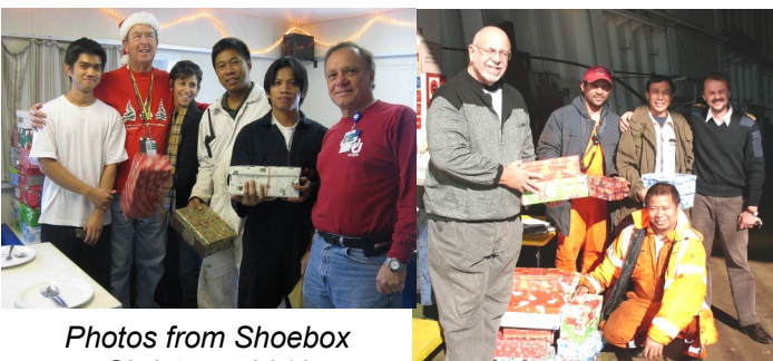
Photos from Shoebox Christmas 2010