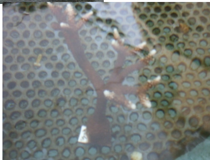
Photo is a close up of some of the coral being grown at the nursery; once it reaches the appropriate size and age, it will be transplanted