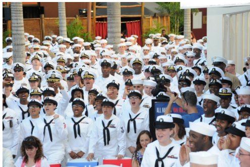
Sailors shown at the All Hands on Deck Welcoming Party at Paradise Shoppes during Fleet Week 2012

Visit Broward Navy Days' website ( www.browardnavydaysinc.org ) for additional information on Fleet Week activities. Information will be emailed to Council members and will also be available on the Council's website ( www.bcnavyleague.org ).