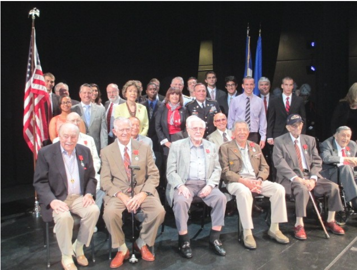
Participants in the Legion of Honor Ceremony and Presentation of USNA Class of 2017