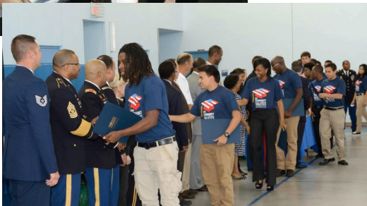
Right and below: Inductees at the Fort Lauderdale event