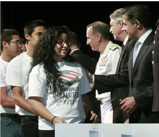
Inductees at Miami event