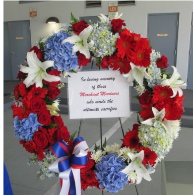
Left: wreath in honor of those merchant mariners who lost their lives