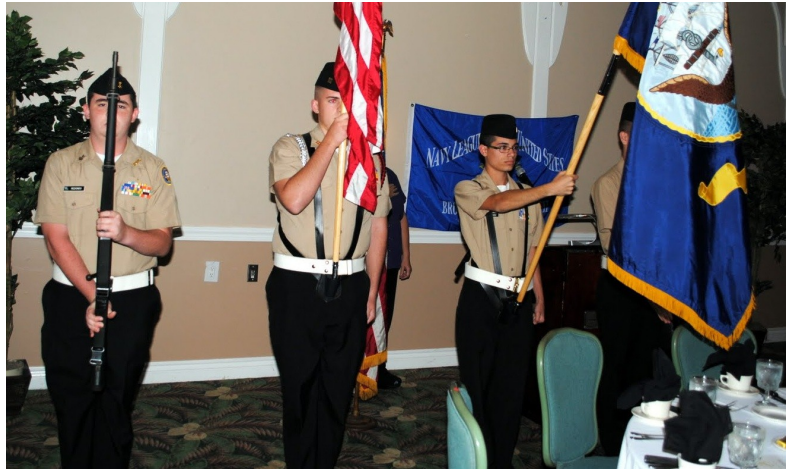
Cooper City NJROTC presenting the colors at the April dinner social

BROWARD COUNTY, FLORIDA COUNCIL, INC. NAVY LEAGUE OF THE UNITED STATES Post Office Box 39252 Ft. Lauderdale, FL 33339-9252