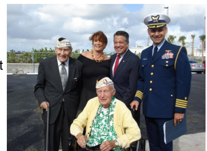
Photo was taken at the 2012 ceremony.

Broward Navy Days will host a remembrance ceremony marking the 72nd anniversary of the Japanese bombing of Pearl Harbor at 1:00 PM on Sunday, December 8 at Coast Guard Station Fort Lauderdale. The last known survivors residing in South Florida will be participating, along with the U.S. Navy Sea Cadets, local Coast Guardsmen and dignitaries. A reception will follow the ceremony.