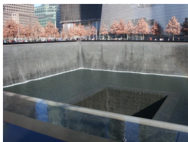
Photo was taken at the 9-11 Memorial.