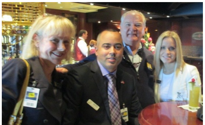
Below: Members of the Fort Lauderdale Council