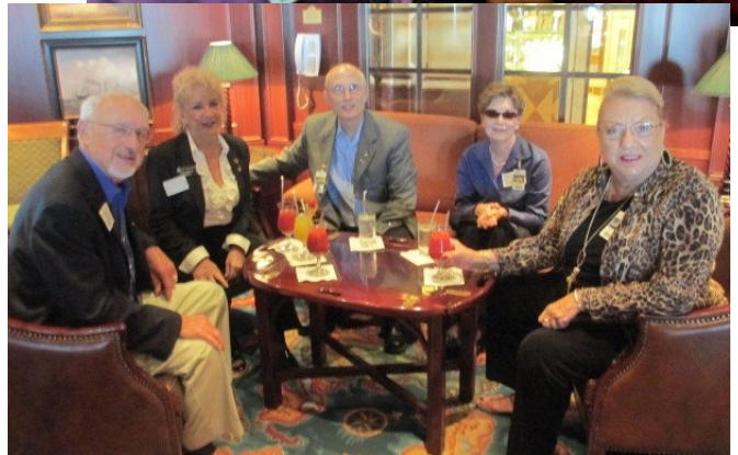
Above: Members of the Boca Raton Council