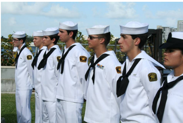
Spruance Division Sea Cadets