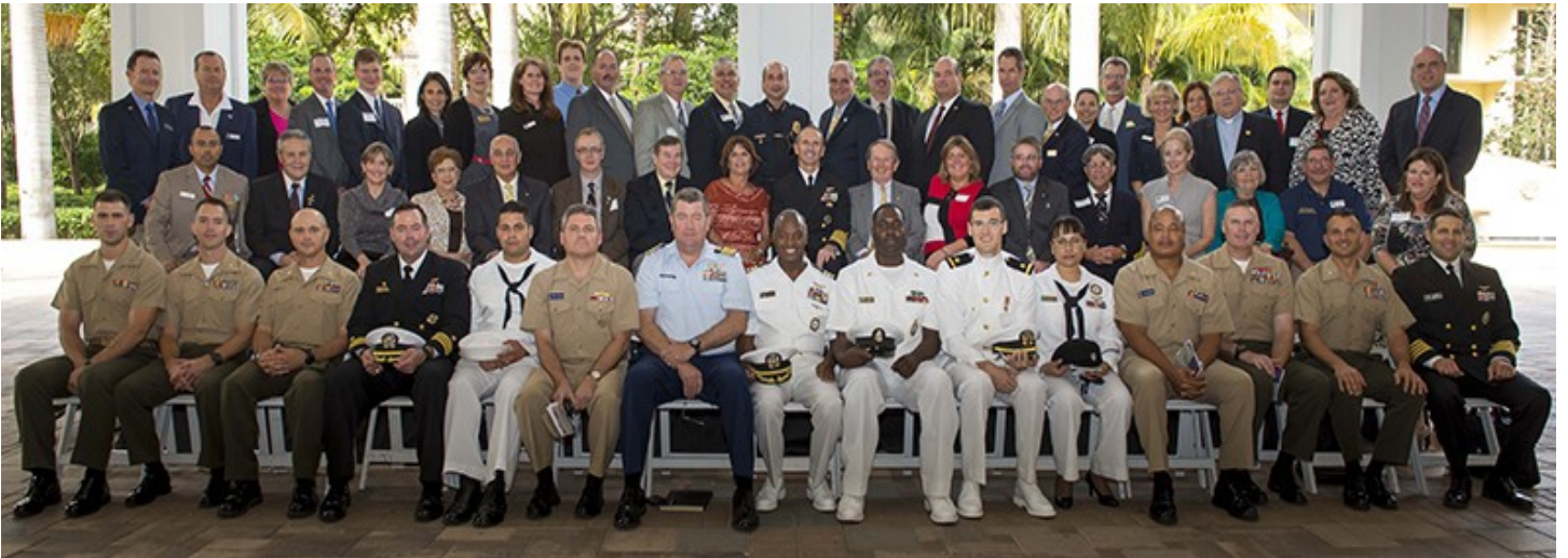
Photo was taken at the November 14th luncheon honoring Chief of Naval Operations Admiral Jonathan W. Greenert

BROWARD COUNTY, FLORIDA COUNCIL, INC. NAVY LEAGUE OF THE UNITED STATES Post Office Box 39252 Ft. Lauderdale, FL 33339-9252