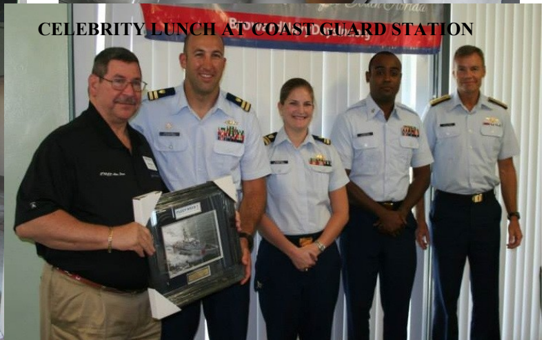
CELEBRITY LUNCH AT COAST GUARD STATION