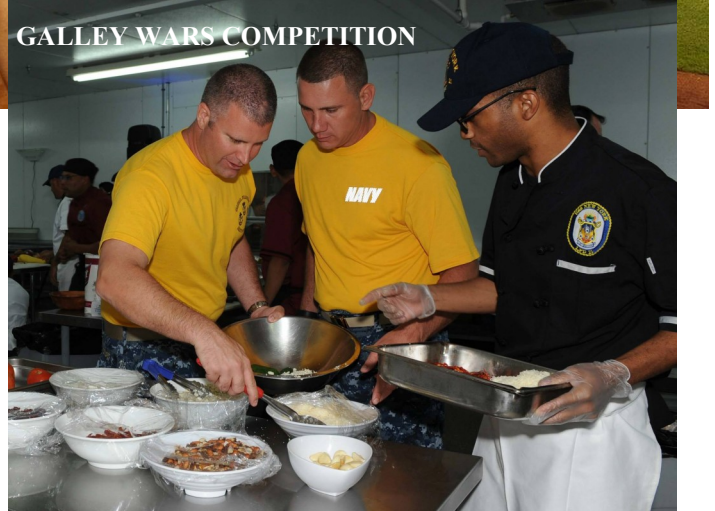
GALLEY WARS COMPETITION