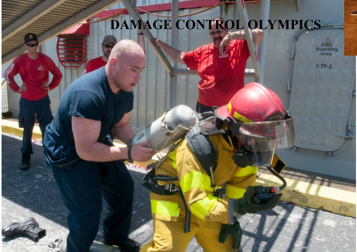
DAMAGE CONTROL OLYMPICS