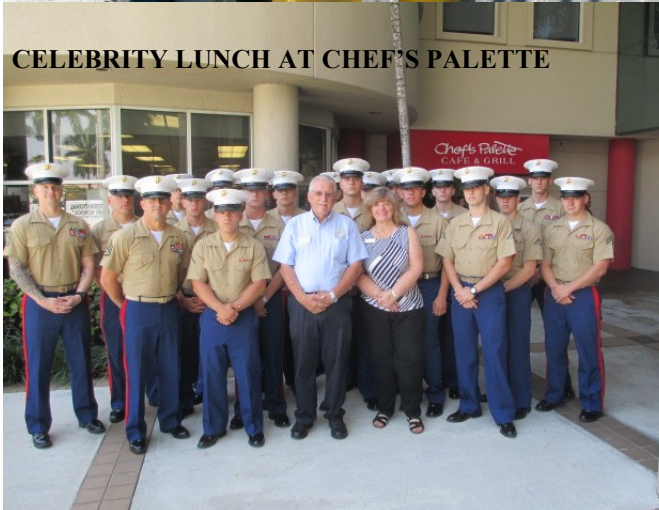
CELEBRITY LUNCH AT CHEF'S PALETTE