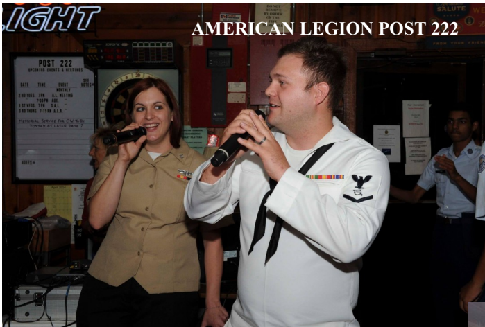
AMERICAN LEGION POST 222