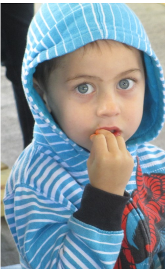
Here are some of the many faces of the Easter egg hunt!