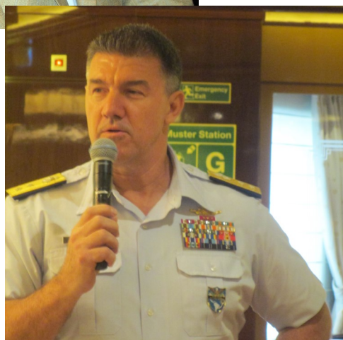
Right: Guest Speaker RADM Karl Schultz