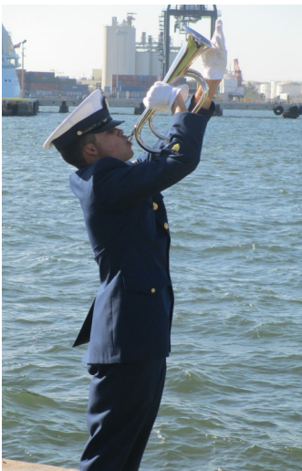
TAPS was played after the remembrance wreath was laid