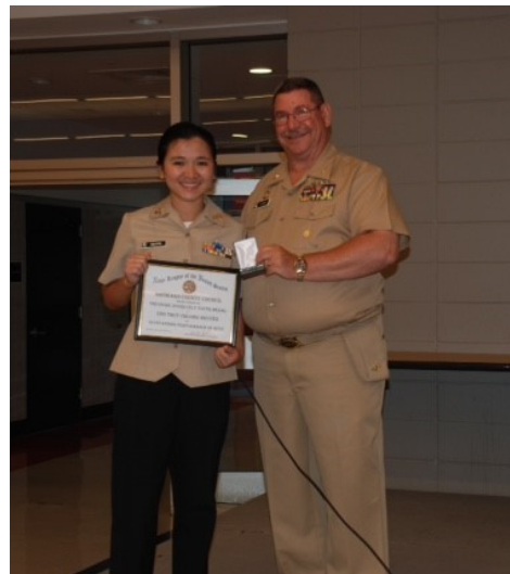
NOVA High School presented Council with plaque for sponsoring their Military Ball