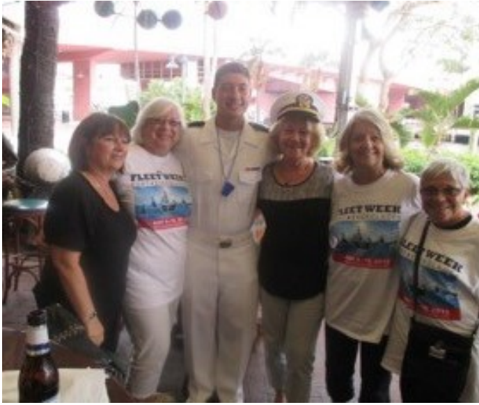
Enlisted persons of the year and their command's leadership with Fort Lauderdale Council board members at the reception at the Hyatt Regency.