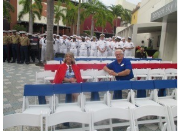
Sailors from USS Cole visit Health Medical Center