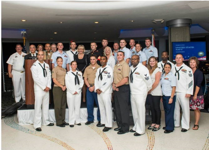
Attendees at Salute to Women in the Military event