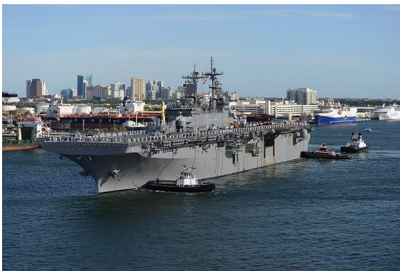
USS Wasp (above) and USS New Hampshire (below) arriving in Port Everglades

This year's Fleet Week brought the USS Wasp, USS James E. Williams, USS Cole, USS New Hampshire and the USCGC Richard Etheridge to Port Everglades on Monday, May 4. Also participating in the many events throughout the week were several local military commands including the Coast Guard, US Southern Command, Navy Recruiting District Miami, and Navy Operational Support Centers Miami and West Palm Beach. The All Hands Welcome Aboard Party kicked off the week and was held in the Paradise Shoppes area of the Seminole Hard Rock Resort. Our council hosted a Junior Officers Party at Briny's Irish Pub on Tuesday evening. The Fort Lauderdale Council sponsored the Sea Services Enlisted Person of the Year Awards at Hyatt Regency Pier 66 on Thursday evening. Annual events such as the golf tournament, Damage Control Olympics, Salute to Veterans and Take a Hero Fishing took place as did community relations events such as visits to local schools and hospitals. New this year was a Salute to Women in the Military event. A VIP reception was held onboard the USS Wasp on Friday and the Galley Wars cooking competition was held at Hugh's Catering on Saturday. World War II veterans were honored on Saturday at a Legion of Honor event aboard the USS Wasp.