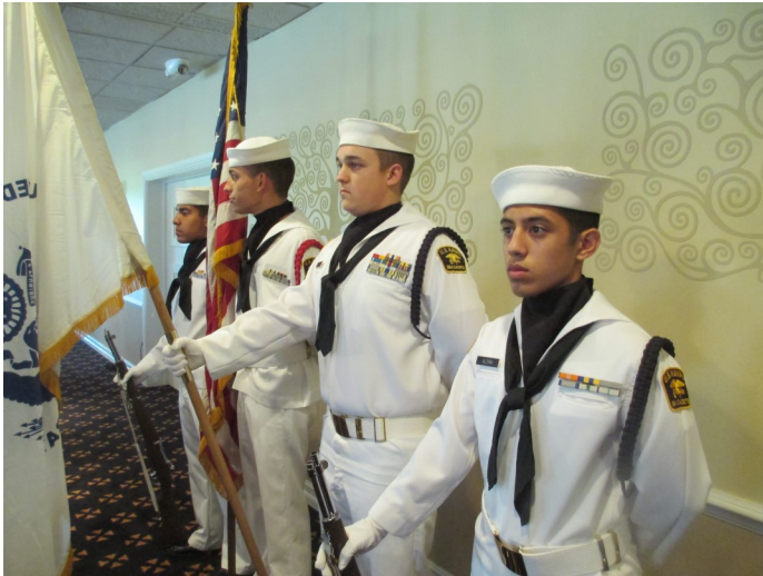
Spruance Division Sea Cadets