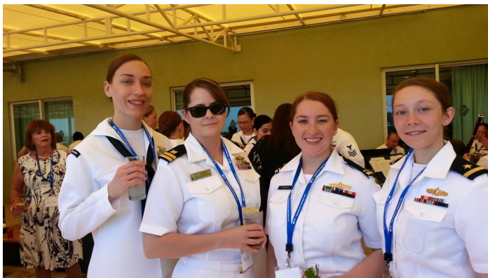
Attendees at Salute to Women in the Military event