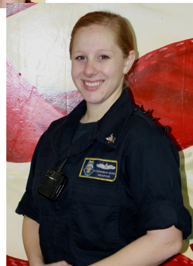
Junior Sailor of the Quarter