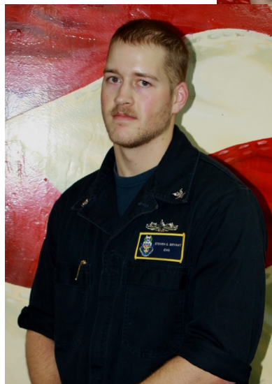
Blue Jacket of the Quarter