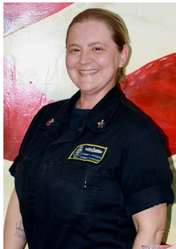
Senior Sailor of the Quarter

The Council's adopted ship, the USS Leyte Gulf, recently advised us of their outstanding crew members who were selected as Sailors of the First Quarter 2015. The Council has honored these sailors with a certificate of accomplishment as well as a monetary award. The sailors are: