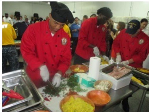
Galley Wars 2015