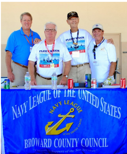
Volunteers at the Council's table during Fleet Week 2015

Galley Wars is a culinary competition among galley crews from the visiting U.S. Navy and Coast Guard ships. The crews will go to battle in the kitchens at Allied Kitchen & Bath's Oakland Park showroom. You will be able to sample Italian cuisine prepared by these military masters and enjoy delicious heavy hors d'oeuvres and live entertainment at one of the most popular events of Fleet Week. After the awards are named by the blue ribbon panel of celebrity chefs and dignitaries, you will be able to head to Oakland Park City Hall for an entertaining concert by Navy Band Southeast. The event is being held on Saturday, May 7 at 6PM at Allied Kitchen & Bath, 2484 NE 12 Avenue, Fort Lauderdale. Tickets are $50 per person. For tickets, visit galleywars2016.eventbrite.com .