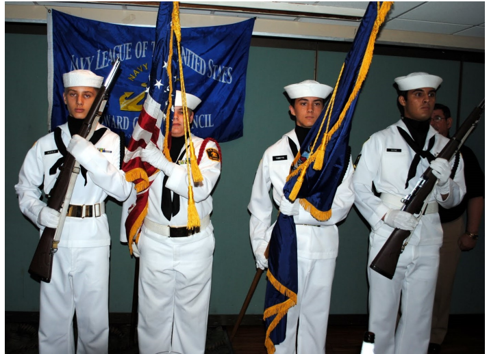
Color Guard Spruance Division Sea Cadets