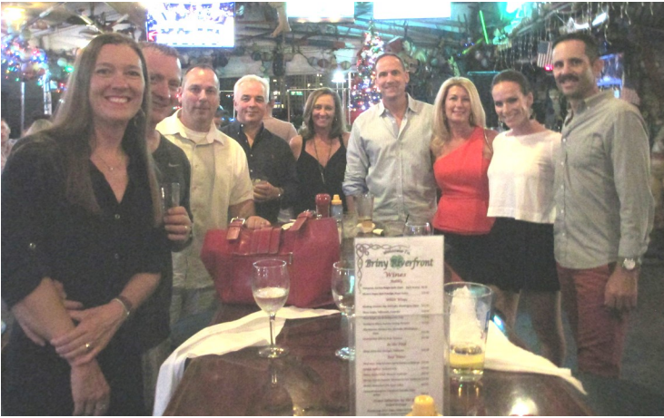
Coast Guard personnel at Briny's Irish Pub for the annual holiday event