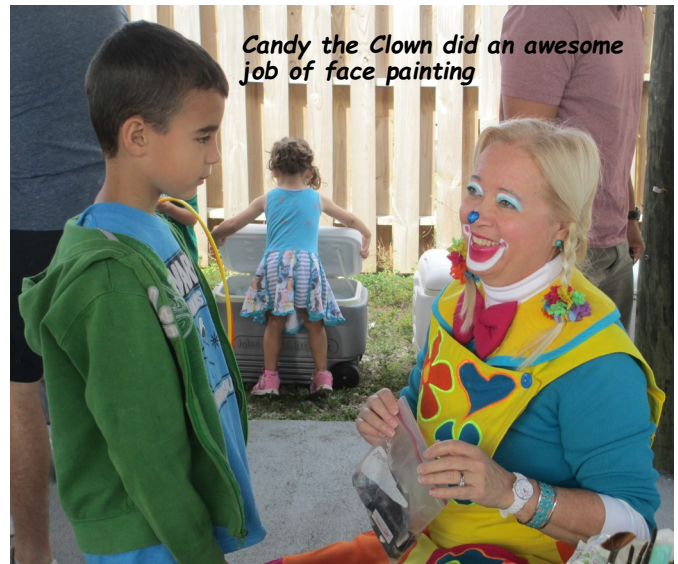
Candy the Clown did an awesome job of face painting