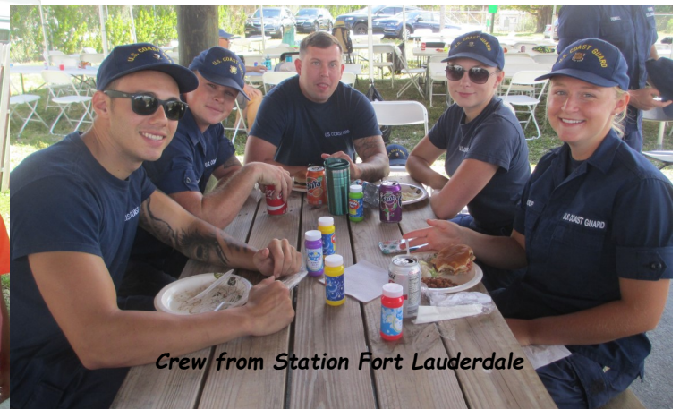
Crew from Station Fort Lauderdale