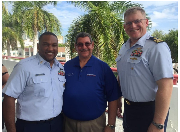
Below: Council volunteers at Port Everglades manning the table to sell beverages/Council coins and to inform visitors about the Navy League