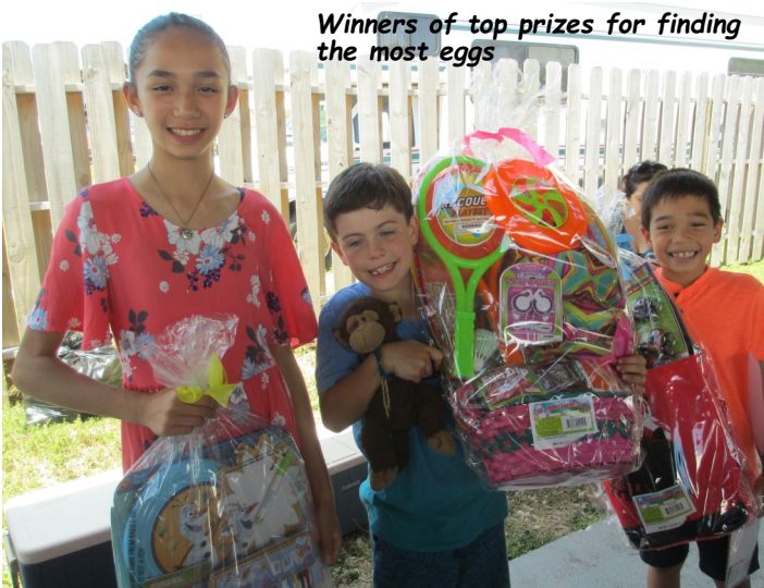
Winners of top prizes for finding the most eggs