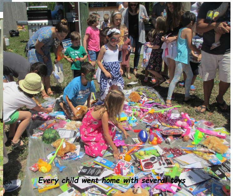
Every child went home with several toys

Thanks to all Coast Guard families who attended this year's event—we hope to see you again next year!