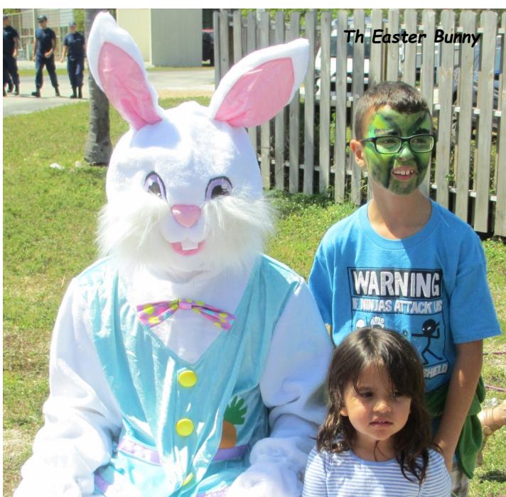
The Easter Bunny