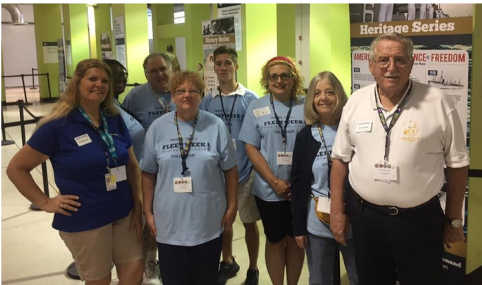
Above: Volunteers assisted during ship tours