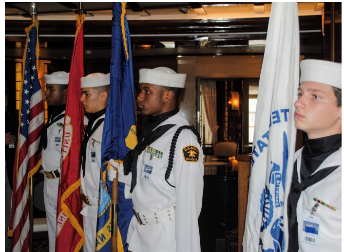
Spruance Division Sea Cadets presented the colors