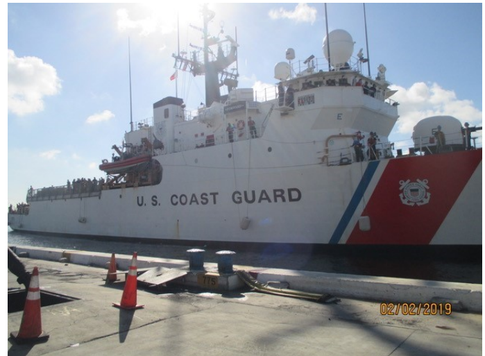
The USCGC Forward had pallets of confiscated drugs on the helo deck, waiting to be unloaded