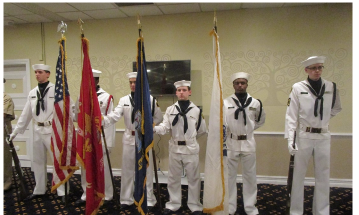
Spruance Division Sea Cadets presented colors