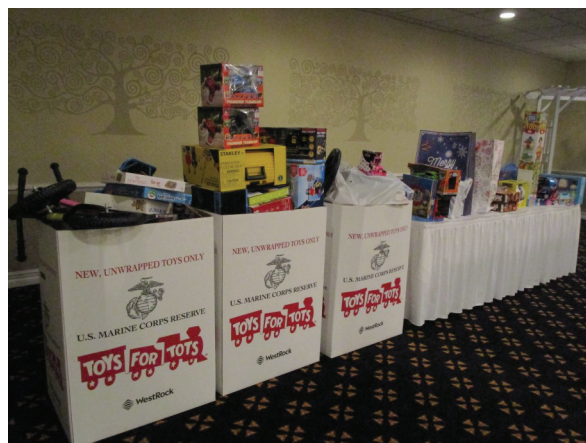
Toys—lots of toys!