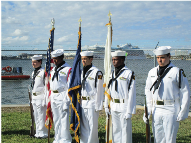
Spruance Division Sea Cadets