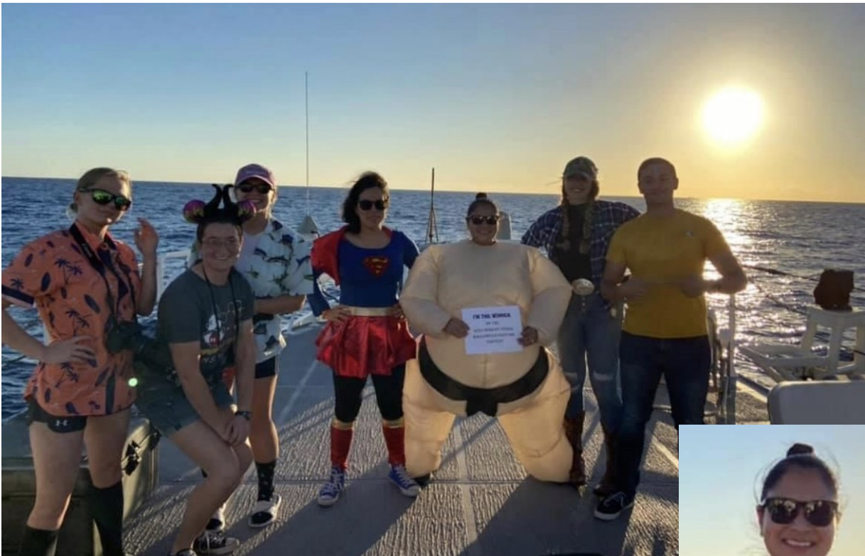
Being underway on Halloween didn't deter the crew of the USCGC Robert Yered from having a little Halloween fun. Here we see some of the contestants in the Halloween costume contest.