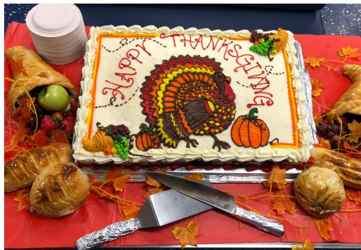
Check out what the Culinary specialists on the USS Leyte Gulf whipped up for Thanksgiving