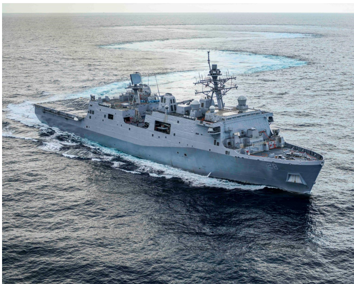
Check out this shot from Huntington Ingalls Industries of the Mighty Fort Lauderdale at sea during Builder's Trials!