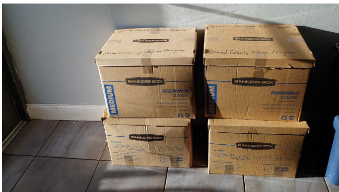
Supplies provided to Coast Guard Station Ft. Lauderdale