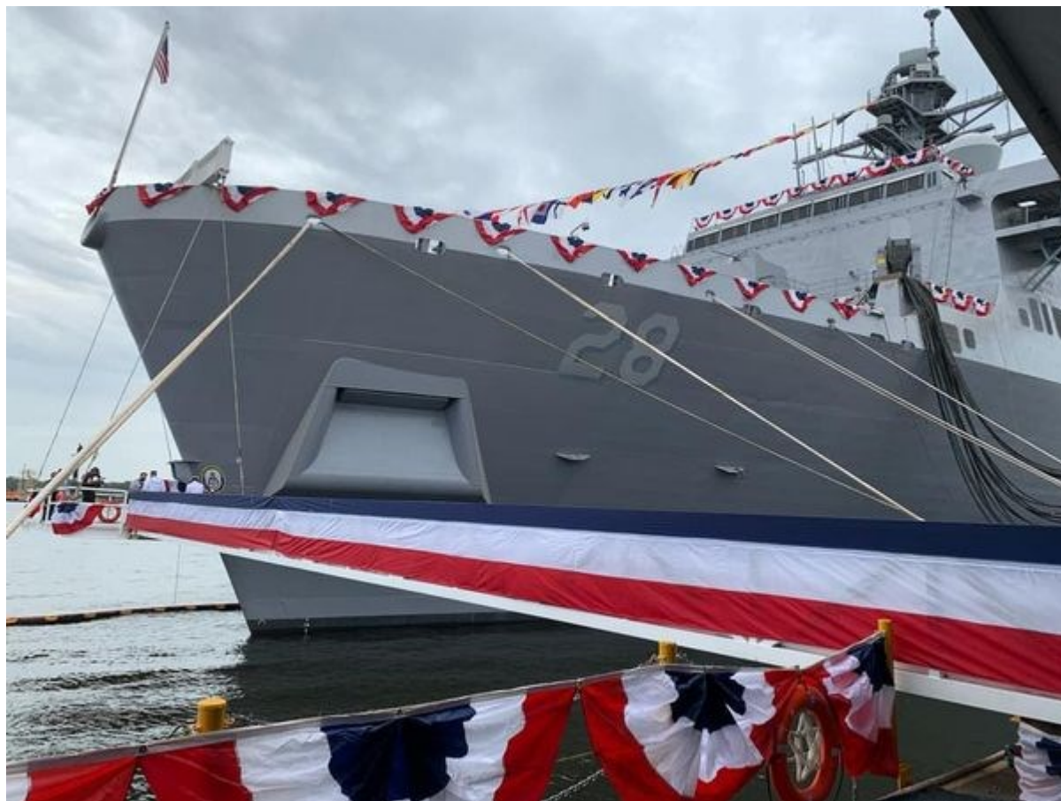
LPD 28 on Christening Day. Pictured in front of the bow is the platform where the official party gathered to break a bottle of sparkling wine over the bow and christen her Fort Lauderdale

Ft Lauderdale now has a ship named after it