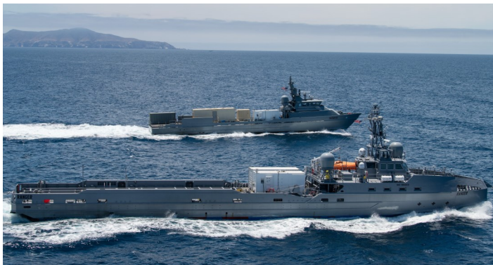
USVs Ranger and Nomad unmanned vessels underway in the Pacific Ocean near the Channel Islands on July 3, 2021.

Ghost Fleet Overlord is a project that is being developed by the Department of Defense’s Strategic Capabilities Office. It is a partnership between SCO and the Navy.