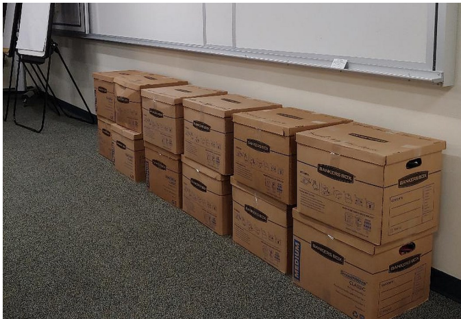
Base Miami Beach supplies

Bravo Zulu Glenn and thanks to Dollar Tree Stores