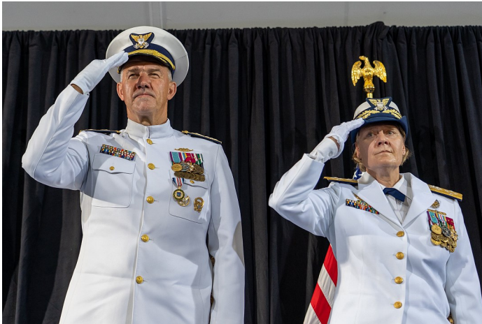
Adm. Linda Fagan relieves Adm. Karl Schultz as the 27th commandant of the Coast Guard during a change of command ceremony at Coast Guard headquarters June 1, 2022.

Adm. Linda Fagan pledged her “highest priority as commandant will be to transform our policy management system” in remarks following her swearing in as the 27th leader of the Coast Guard and the first woman to lead a branch of the armed services.