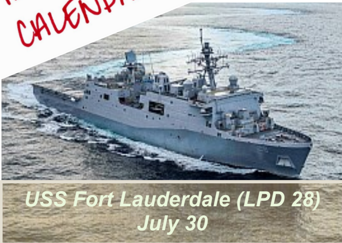
USS Fort Lauderdale (LPD 28) July 30