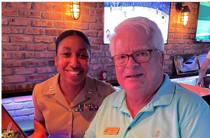
Unfortunately this year we only had one Marine able to attend.