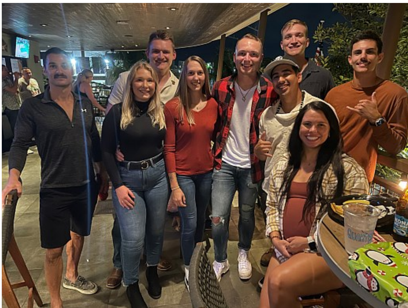
Members and Guests of Coast Guard Station Fort Lauderdale

On December 1st we along with the Ft Lauderdale Council and Broward Navy Days held our annual Holiday Party for local Coast Guard units.