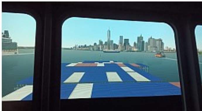
Simulated view from bridge of ship entering NY harbor