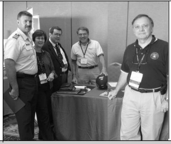
Council members publicize NBA teams to host Military Appreciation Nights at games throughout the season.