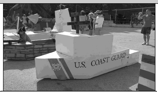
CGC AVDET GTMO