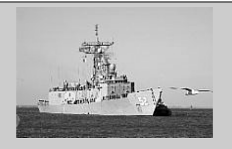
USS CARR (FFG 52) COMING HOME

PEO Ships is responsible for the development and acquisition of U.S. Navy surface ships and is currently managing the design and construction of a wide range of ship classes and small boats and craft. These platforms range from major warships, such as front line surface combatants and amphibious assault ships to air-cushioned landing craft, oceanographic research ships and special warfare craft. PEO Ships has delivered 33 major warships and hundreds of small boats and craft from more than 30 shipyards and boat builders across the United States.