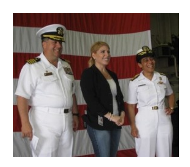
Cub Scout Pack 441 aboard the USS Iwo Jima