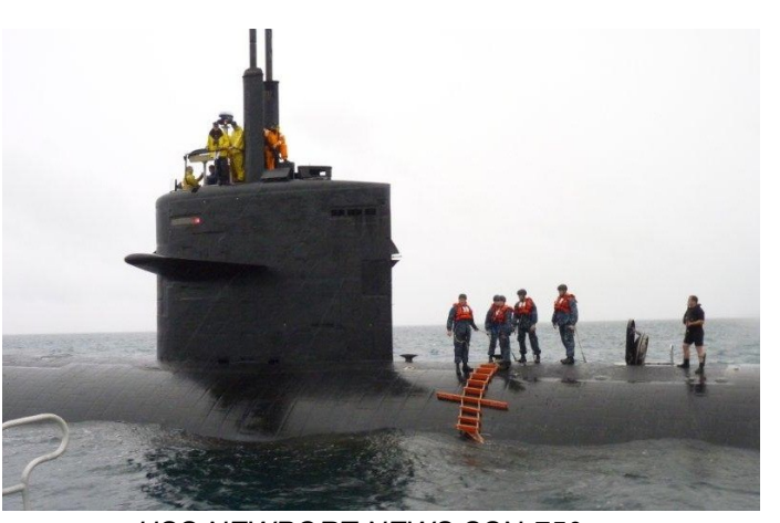
USS NEWPORT NEWS SSN-750