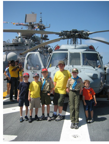
Cub Scout Pack 7 / Boy Scout Troop 7 Coral Gables enjoyed a tour aboard the USS Iwo Jima