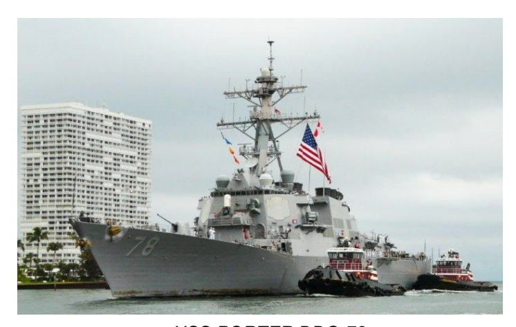
USS PORTER DDG-78