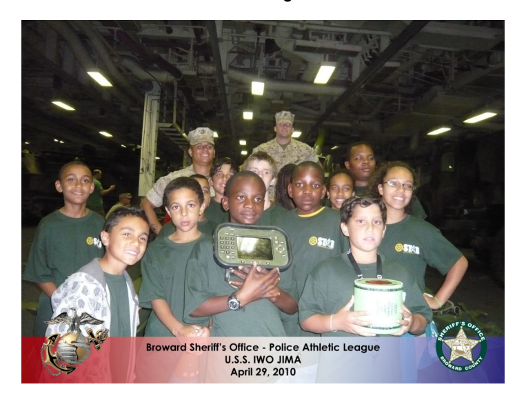
A group of children from the Police Athletic League of the Broward Sheriff's Office enjoyed their tour of the Iwo Jima