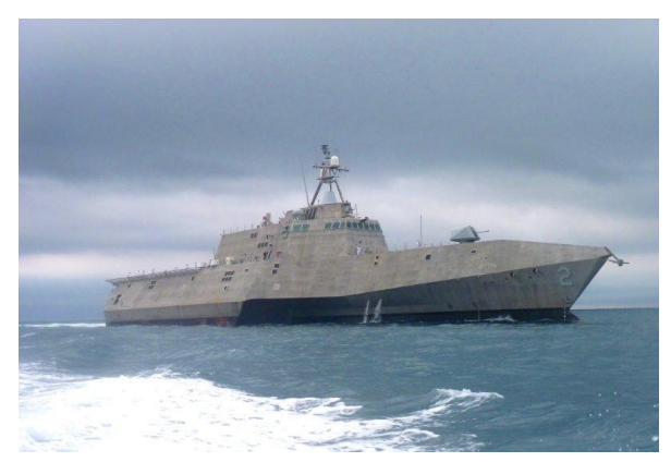
USS INDEPENDENCE LCS-2