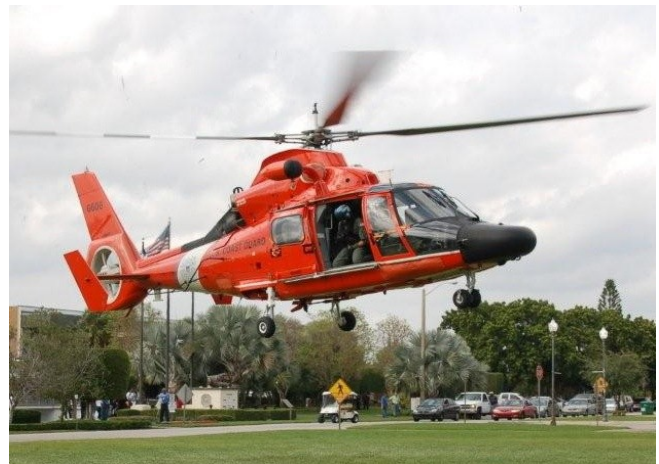
Air Station Miami MH-65C Dolphin lands at Florida Memorial University's 'Black Pioneers of Aviation' symposium