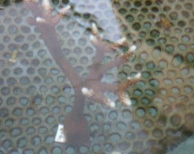
Photo is a close up of some of the coral being grown at the nursery; once it reaches the appropriate size and age, it will be transplanted

Board member Joe Giambrone learns about the efforts taking place to culture coral at the coral nursery