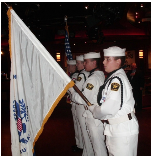
Spruance Division Sea Cadets

A huge thank you goes to Princess Cruises for hosting our event. Thanks also to everyone who supported this major Council fundraiser.