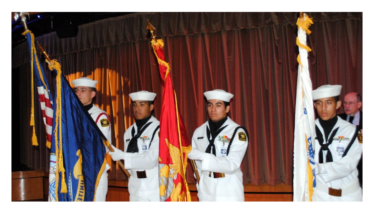
Spruance Division Sea Cadets presented colors