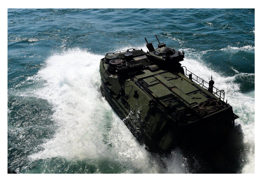
In mid-April, Marines attached to 1st Battalion, 2nd Marine Regiment, Bravo Company from Camp Lejeune, North Carolina joined the USS Bataan for training. Here are a few photos taken during recent training that appeared on the Bataan's Facebook page.