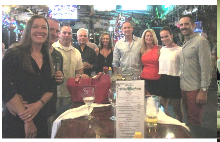
Coast Guard personnel at Briny's Irish Pub for the annual holiday event \,