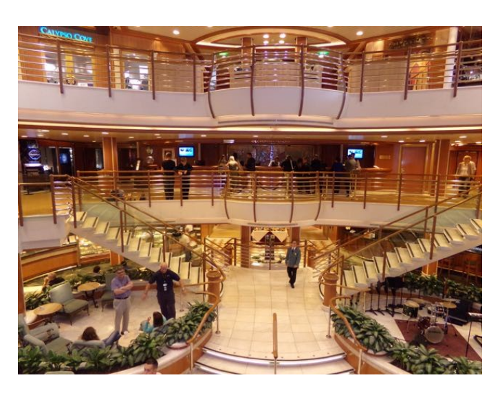
Atrium of the Caribbean Princess