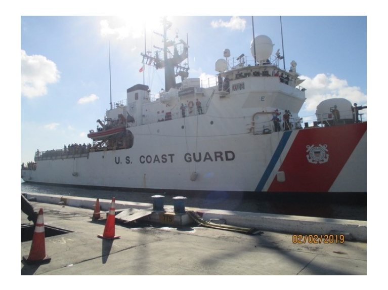
The USCGC Forward had pallets of confiscated drugs on the helo deck, waiting to be unloaded