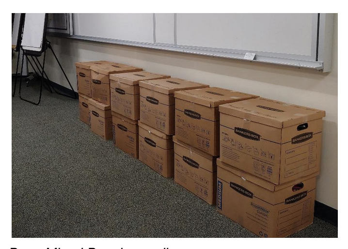
Base Miami Beach supplies

Bravo Zulu Glenn and thanks to Dollar Tree Stores