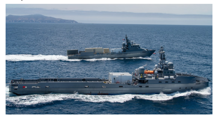
USVs Ranger and Nomad unmanned vessels underway in the Pacific Ocean near the Channel Islands on July 3, 2021.

Ghost Fleet Overlord is a project that is being the developed by the Department of Defense's Strategic Capabilities Office. It is a partnership between SCO and the Navy.