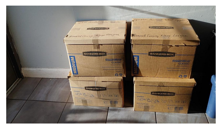
Supplies provided to Coast Guard Station Ft. Lauderdale