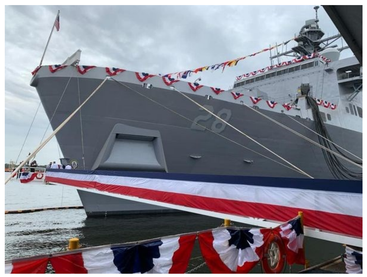
LPD 28 on Christening Day. Pictured iin front of the bow is the platform where the official party gathered to break a bottle of sparkling wine over the bow and christen her Fort Lauderdale

PASCAGOULA, Miss. (Aug. 21, 2021) — Huntington Ingalls Industries (NYSE: HII) announced today that its Ingalls Shipbuilding division christened amphibious transport dock Fort Lauderdale (LPD 28).