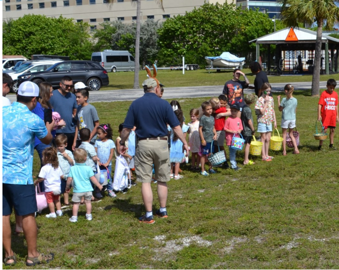
Getting ready to go after the Eggs