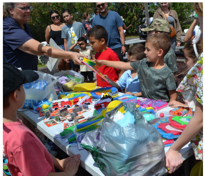
Prizes and gifts