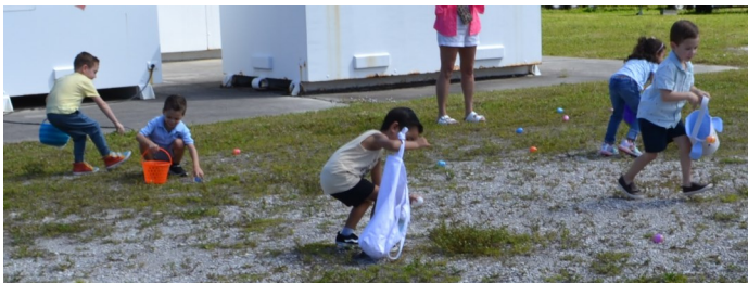
Grab them Eggs